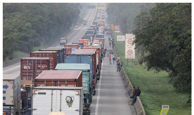
Bottleneck congestion at the Port of Santos.